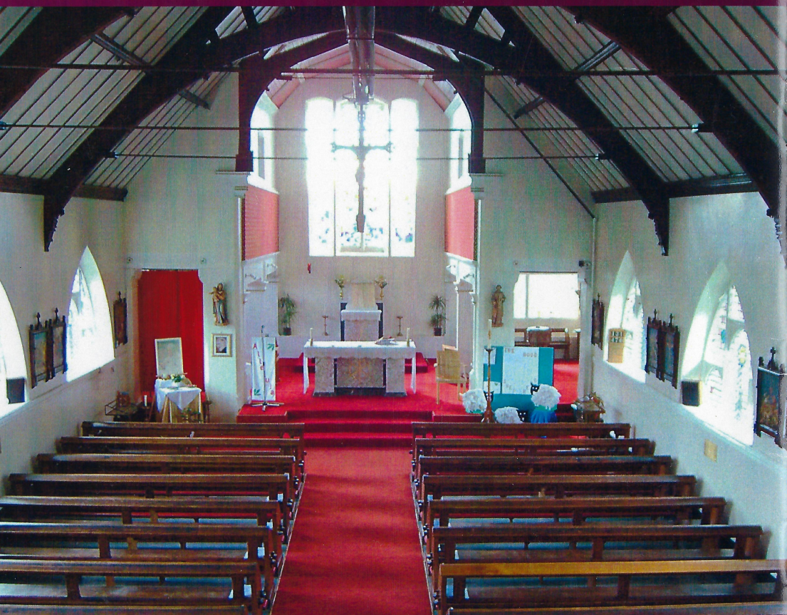
Church interior, 2005